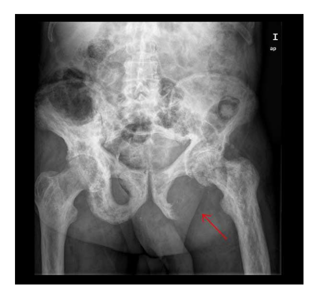
Fig. 1. Multiple lesions compatible with Paget's disease and a larger lytic image on the left is him