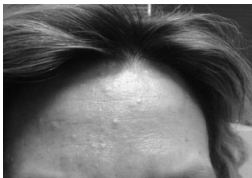
Fig. 2. Facial angiofibromas.

was defined by biopsy as diffuse proliferative glomerulonephritis (World Health Organization type IV). She was treated with high-dose glucocorticoids (1 mg/kg/day) and 6 cyclophosphamide pulses/month (750 mg/m 2 body surface area) to induce remission, followed by 1 cyclophosphamide pulse every 3 months for 2 years, with no complications. Since then, the patient has continued to take hydroxychloroquine and low-dose glucocorticoids. Her renal function has remained normal, and she has had no further serious manifestations of SLE or significant laboratory abnormalities, including complement levels and cell counts. She still tests positive for antinuclear antibodies, at a titer of 1:640, and has an anti-double-stranded DNA antibody level (enzyme-linked immunosorbent assay [ELISA]) of 18 IU/mL (slightly over the upper normal limit of 15 IU/mL).