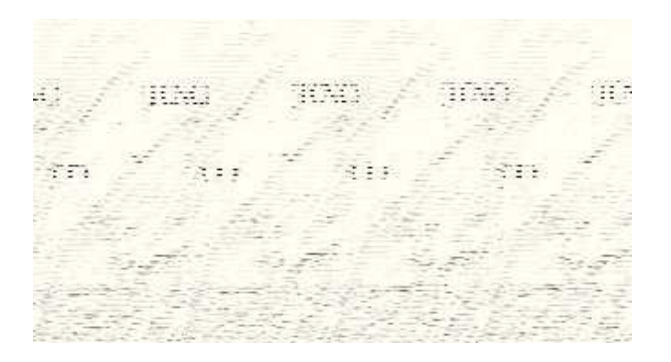
Figure 3. Peroneal brevis common sheath. The tendon with endo and epitendon, separated by a fragmento of non calcified connective tissue (10).