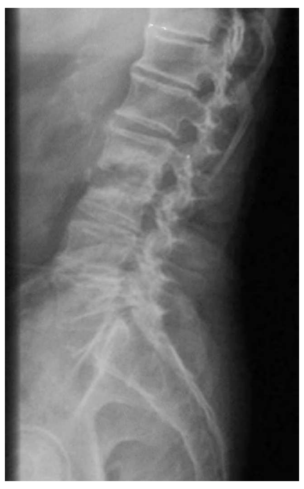
Figure 1. Lumbar spine x-ray that shows a reduction in disk space between the second and third lumbar vertebrae, as well as a reduction in the morphology of the joint facets.

radiologic evolution showed a resolution of the infectious process. Today, and after 24 months of treatment, the patient is asymptomatic and control x-rays have not been modified.