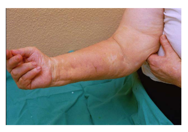
Fig. 2. Contracture of the fourth and fifth fingers of the right hand.

function testing. Two months later during routine visits the patient complained of the presence of papule-plaques involving the trunk and extremities accompanied by pain in the right hand together with flexion contracture of the 4th and 5th fingers of the right hand. The skin had a brownish appearance, and the arms and the legs were hyperpigmented (figs. 1 y 2). A punch biopsy of the skin showed a preserved epidermis with a fibrosed dermis with numerous collagen bundles and numerous fibroblast-like cells and absence of inflammatory infiltrates or plasma cells. Alcian blue stain demonstrates mucin deposits (fig. 3). A magnetic resonance (MR) of the arm showed an increased signal in the septum of subcutaneous cellular tissue with a "paved" appearance (fig. 4).