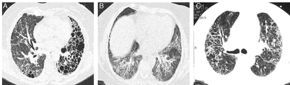
Fig. 1. Representative CT images of RA-ILD patients. (A) Cystic lesions of subpleural and basal distribution resembling those seen in usual interstitial pneumonia, associated with areas of ground glass. (B) Ground glass with central distribution, respecting subpleural areas and discrete reticulation, resembling the pattern observed in the nonspecific interstitial pneumonia. (C) Reticulation and ground glass diffusely distributed, bronchocentric, being an indeterminate pattern of interstitial lung disease.

was 64 months. No differences were found between DMARDs and survival.