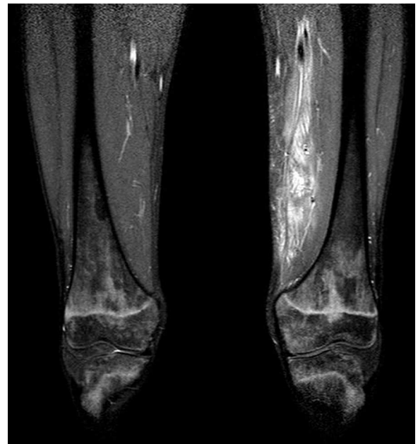
Fig. 2. The MRI study revealed the suspected pyomyositis.

When pyomyositis occurs in immunocompromised patients, as in the case reported here, we may have doubts about the convenience of surgical debridement because of fear of well known