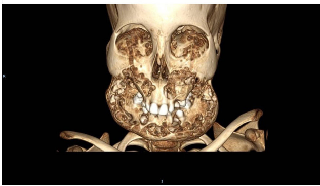
Fig. 1. 3D-reconstruction of patient lesions.

lymphadenopathy. In view of these findings, we decided to perform a panoramic radiograph and a head CT scan in order to guide the diagnosis. This tests showed several multilocular cysts in all four quadrants of jaws (Fig. 1). No significant alteration was observed with biochemical analysis of calcium metabolism. Finally, an incisional biopsy of cystic tissue was carried out. Histopathological examination evidenced many multinucleated giant cells. By correlating clinical, radiographic and histopathological features a final diagnosis of cherubism was made. After diagnosis, patient was referred to an ophthalmologist with the aim of beginning a routine screening of the visual acuity. No alteration was evidenced by eye examination. Against this backdrop, we decided to keep a conservative attitudes.