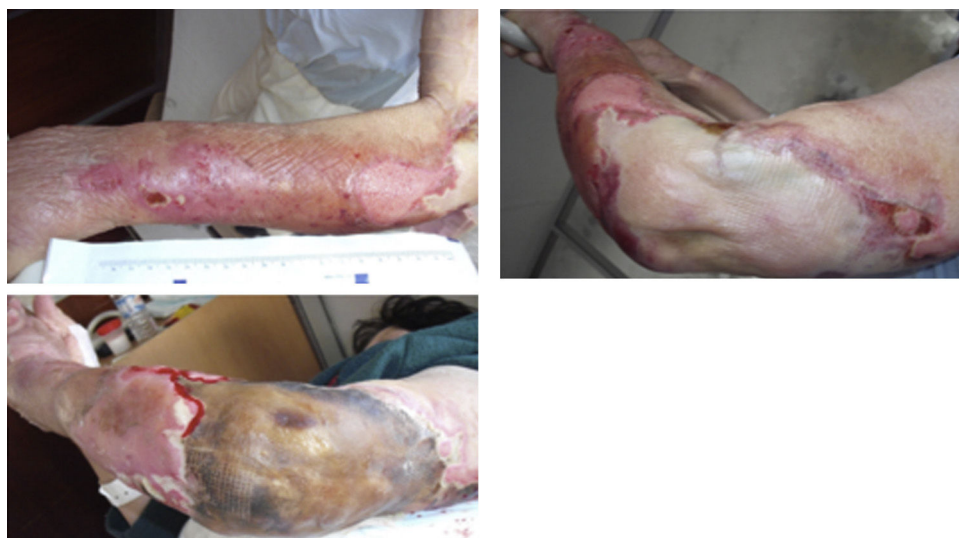
Figure 1. Evolution of skin lesions at first five days of internment: áreas of extensive skin detachment in the context of ruptura of blisters and severe exudation and necrotic áreas.

metacarpophalangeal, interphalangeal and wrist joints. Left upper limb presented diffusely oedematous with a slight erythematous rash and increased temperature. Laboratory tests were as follow: hemoglobin 12.3 g/dl; white blood cell (WBC) count 11.8 \times 10^9/l