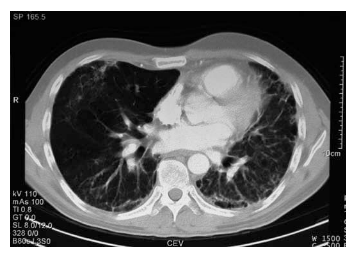
Figure 2. Interstitial lung disease with bilateral "honeycombing."

subpleural and cervical emphysema, lung fibrosis and areas with a "ground-glass" appearance in the left inferior lung lobe parenchyma. A search for possible foci of infection was carried out and turned out negative. A bronchoscopy found a necrotic lesion in the intermediate bronchi. This lesion was considered to be the origin of the pneumomediastinum.