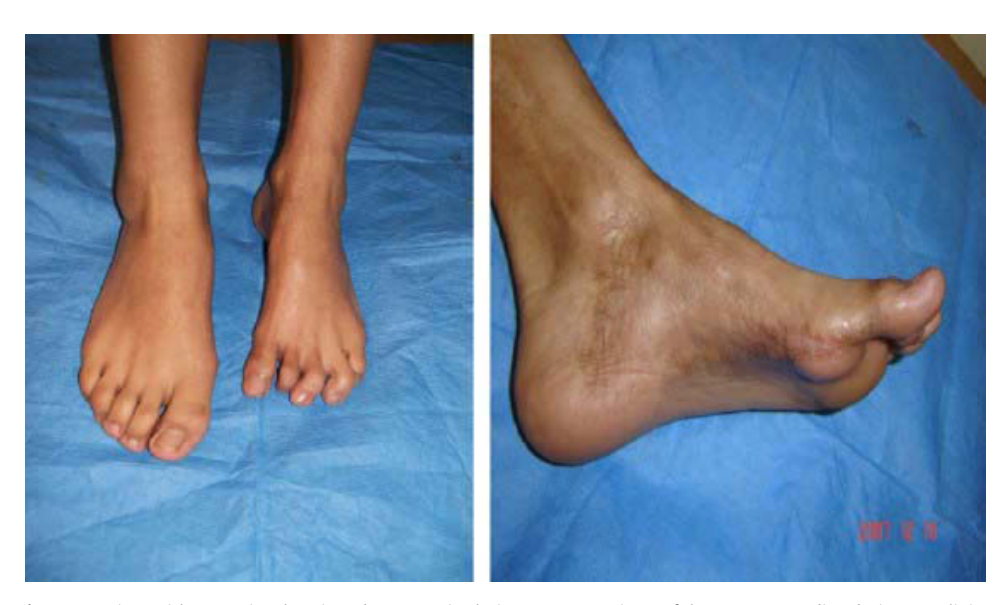
Figure 1. Patient with systemic sclerosis and an extensive lesion.