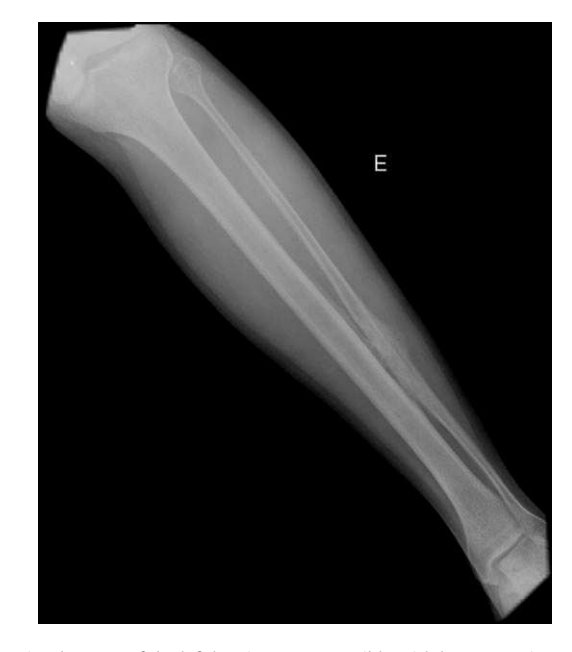
Fig. 1. Simple X-ray of the left leg: image compatible with hyperostosis and thickened cortex of the mid third of the tibia and peroneus exten ding along the bone and showing an image of "dripping candlewax".

E-mail addresses: tareto4@hotmail.com, 98383@imas.imim.es (T.C. Salman Monte).