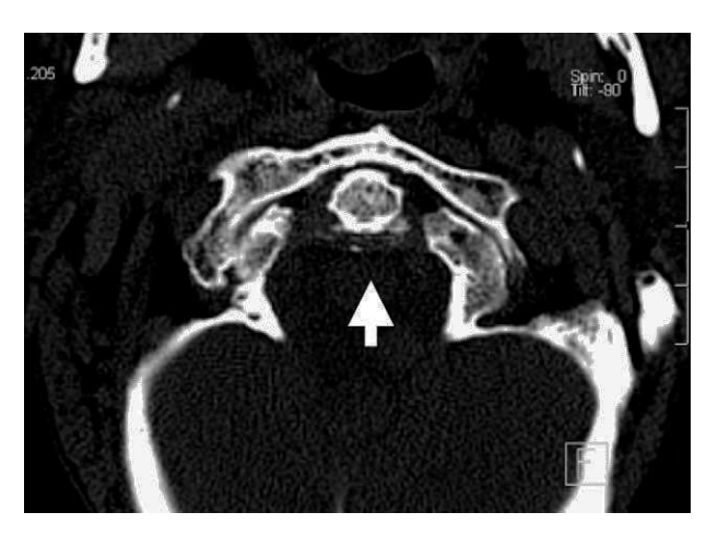
Fig. 3. Cervical CT: calcification of the transverse odontoid ligament (axial).