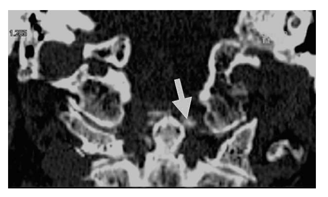
Fig. 1. Cervical CT: calcification of the transverse odontoid ligament (coronal).

We present the case of an 82-year-old woman who consulted us due to intense cervical pain which responded poorly to analgesics. She had a history of atrial fibrillation undergoing anticoagulation therapy, spondyloarthritis and radiologic chondrocalcinosis of the knees. Physical examination revealed spontaneous pain on the cervical spine, radiating to the occipital and mastoid regions, with stiffness and movement limitations due to pain, with no neurologic manifestations.