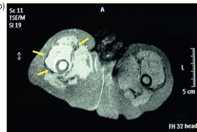
Fig. 2. a) Hip MR. b) Right hip MR: septic right coxofemoral osteoarthritis with femoral osteomyelitis that affects the proximal half of the femur.

CT was compatible with pulmonary tuberculosis (Fig. 3). A hip arthrotomy with cleansing of the zone and biopsy was performed. Zhiel-Nielsen staining showed acid-fast bacilli, and treatment with quadruple therapy (isoniazid, rifampicin, pyrazinamide and