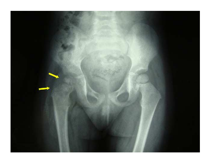
Fig. 1. Simple hip X-ray: de-structuration of the right femoral head.

Because of the poor progression, the origin of the patient and the radiologic findings, a more ample study was undertaken, performing Mantoux testing which was positive (22 mm) and a chest X-ray which posterior upper left lung lobe segment consolidation. Thorax