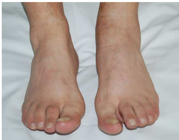
Fig. 1. Diffuse swelling of the second right toe (dactylitis) and arthritis of the left ankle.

finger of his left hand. The right knee and left ankle were subsequently swollen (Fig. 1). Coinciding with the joint manifestations, the patient developed fever (up 38.8°C, without associated dysthermia), purulent urethral discharge and self-limiting diarrhea during the first 2 days. He did not present eye inflammation or skin lesions, and had no limitations or inflammatory signs of the axial skeleton or entheses. The patient denied similar previous episodes of arthritis, back pain or history of inflammatory or heel pain, but had a family history of spondyloarthritis (a brother with ankylosing spondylitis [AS]).