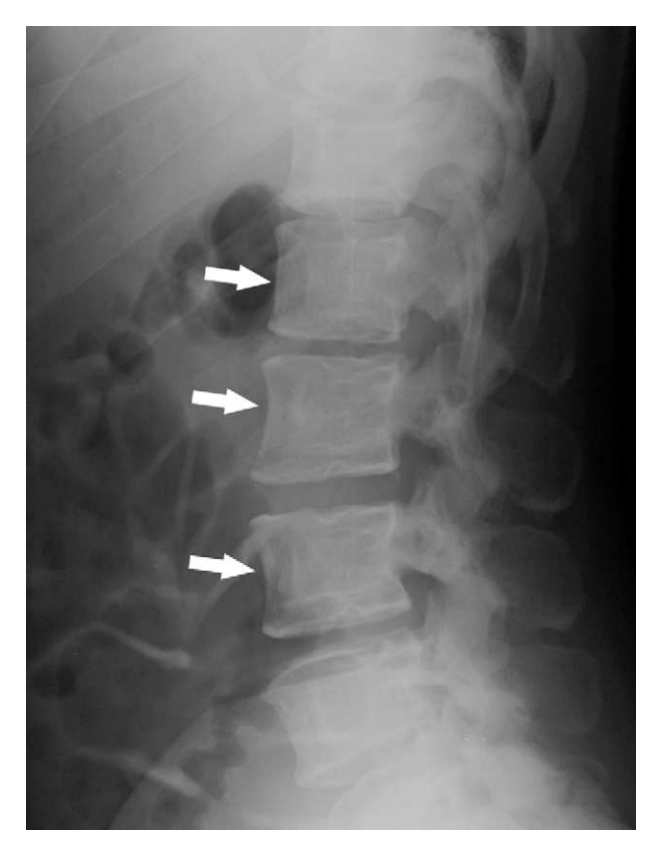
Fig. 2. Lateral radiograph of lumbar spine showing similar findings to those of the thoracic spine (white arrows).