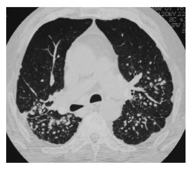
Fig. 1. Pneumoconiosis and pulmonary rheumatoid nodules.

The peripheral blood smear showed lymphocytosis by LGL (Fig. 2), which in the immunophenotype corresponded to 42% of