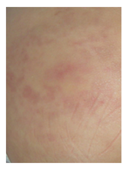
Fig. 1. Erythematous, raised lesions on the buttocks (factitious panniculitis).

10 years. She had a history of liquid silicone injections in the buttocks 3 years earlier while in Colombia.