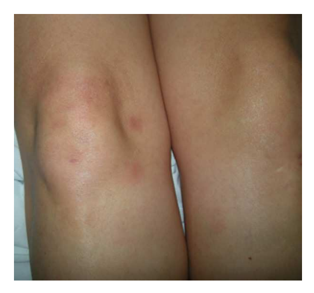
Fig. 4. Painful erythematous nodules on the legs (erythema nodosum).

a mixed, septal panniculitis with granulomas without necrosis, compatible with erythema nodosum with no evidence of silicone material (Fig. 6). The Ziehl-Neelsen and PAS stains were negative. She was treated with NSAIDs (indomethacin 50 mg/8 h), with