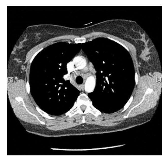
Fig. 3. Chest CT: hilar and mediastinal lymphadenopathy (grade 1 sarcoidosis).

During admission we also found palpable and painful erythematous nodular lesions on the tibial region of both lower limbs (Fig. 4). After consulting with the dermatologist we performed a biopsy of the skin lesions of the buttocks and lower limbs. Pathology reported many histiocytes laden with lipid-containing cytoplasmic vacuoles affecting the septa and adipose tissue, which supported, given the clinical context, a diagnosis of factitious panniculitis due to silicone (Fig. 5). In contrast, biopsy of the skin over the pretibial showed