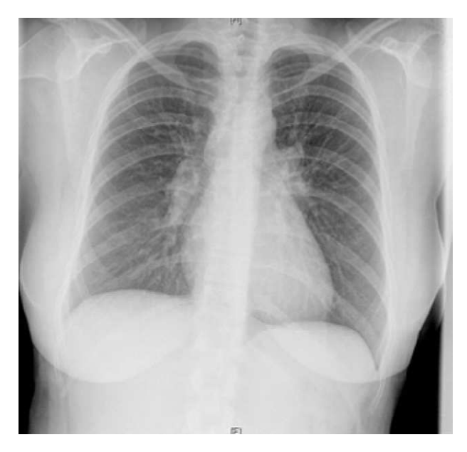
Fig. 2. X-ray: bilateral hilar lymphadenopathy.

As additional evidence, a blood test showed normocytic and normochromic anemia with a hematocrit of 27.7% (nv 36-45) and hemoglobin of 9.4 g/dl (nv 12-16), together with a platelet count of 540,000 (nv 130-450). A search for iron deficiency showed (Fe: 18; vn 37-145) with normal ferritin, vitamin B12, folic acid and serum protein, and a peripheral blood smear which only highlighted a slight basophilia. The rest of the analytical studies only revealed subclinical hypothyroidism, with a slightly elevated TSH and normal thyroid hormones, for which we consulted the endocrinology department, which stated that the patient did not require replacement therapy. There was no leukocytosis or left shift, and renal and hepatic functions, ions and coagulation were normal. Acute phase reactants showed a sedimentation rate of 110 mmHg and C-reactive protein 28.8 mg/dl. Autoimmunity testing revealed rheumatoid factor of 24 U/l, antinuclear antibodies 1/80, with negative anti neutrophil cytoplasmic antibodies. The angiotensin converting enzyme (ACE) was within normal values (ECA: 38; vn 18-58). Requested blood cultures were negative, and urine sediment was normal. Requested serology for hepatitis, human immunodeficiency virus, rubella, cytomegalovirus, Epstein-Barr virus, Toxoplasma, Treponema pallidum, Borrelia, Mycoplasma and Chlamydia were negative.