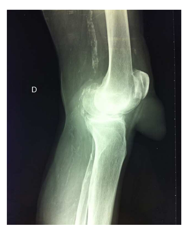
Fig. 2. Lateral radiograph of the knee under load.