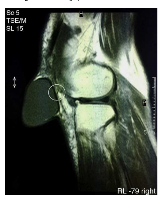
Fig. 3. MRI of the knee. Within the circle the crease of the rear wall of the cyst is identified.