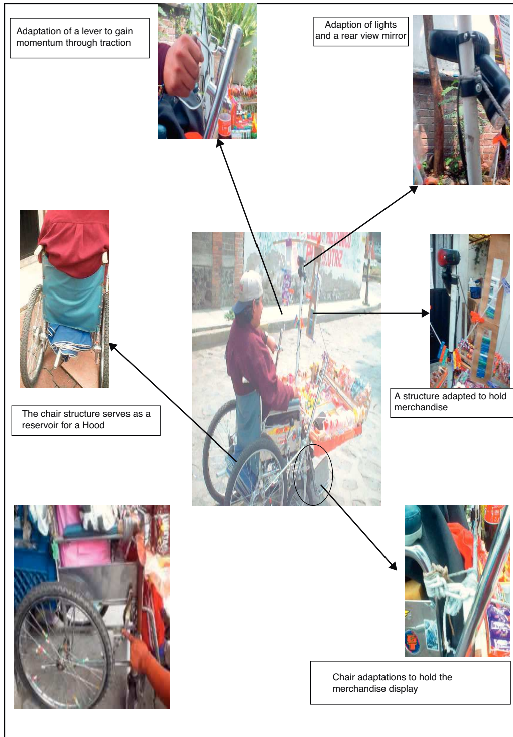
Fig. 3. Relationship of physical and social barriers expressed in the triad (disabled user status, wheelchair and activities of daily living) and their impact on the practical acceptability, social and usability problems presented in conducting activities.

The user-centered design, a universal design (The Center for Universal Design, 1997), social integration and potential access are issues that emphasize security requirements and the elimination of architectural and urban barriers. 27,28