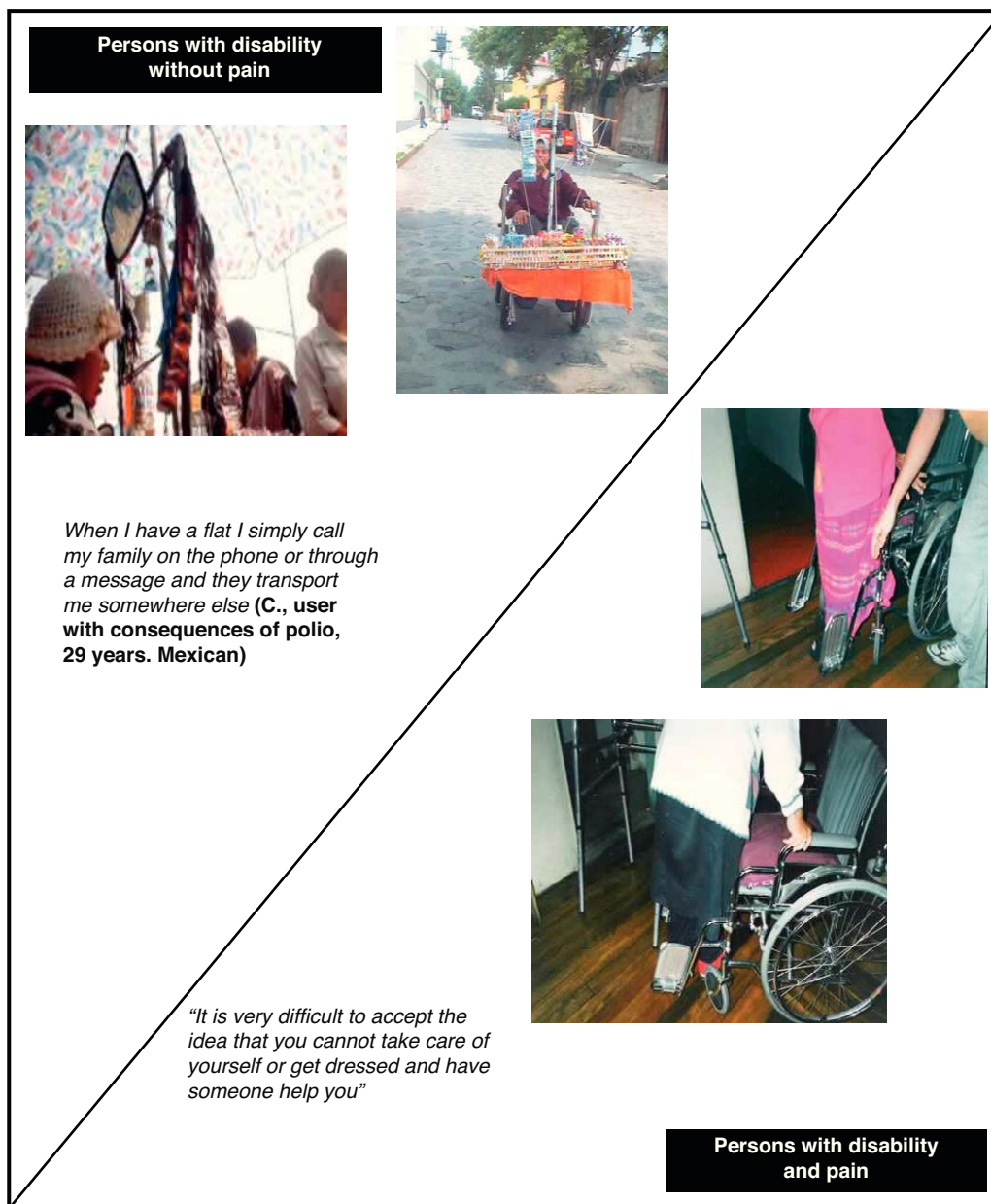
Fig. 2. Gives the user identity to the wheelchair, which also becomes their workplace; adaptations were made by the user.

especially from the perspective of people who, despite their deficiency are not considered sick. An ergonomically correct approach to the design should incorporate the specific requirements of these populations, resulting in compatible solutions with any user. 21