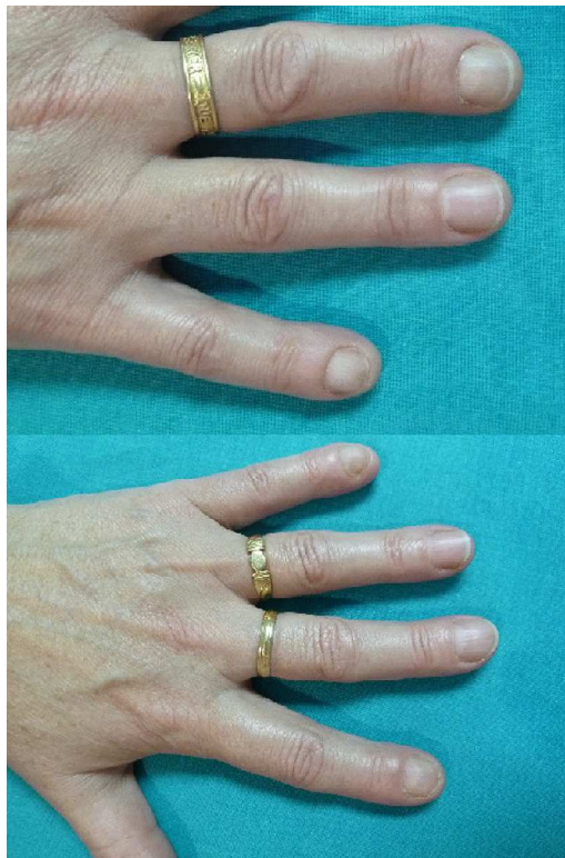
Fig. 2. Fingernails with no alterations after 6 months.

onychomycosis and differential diagnosis must also be made with other processes, including self-induced nail dystrophy (Table 1).