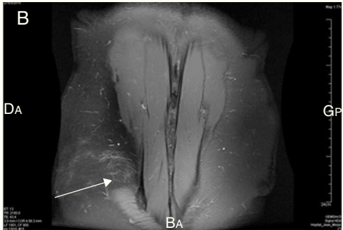
Fig. 1. Axial and coronal planes of the patient's MRI, both showing T2-Fat saturation high signals in intramuscular structures. (A) Axial plane. (B) Coronal plane.