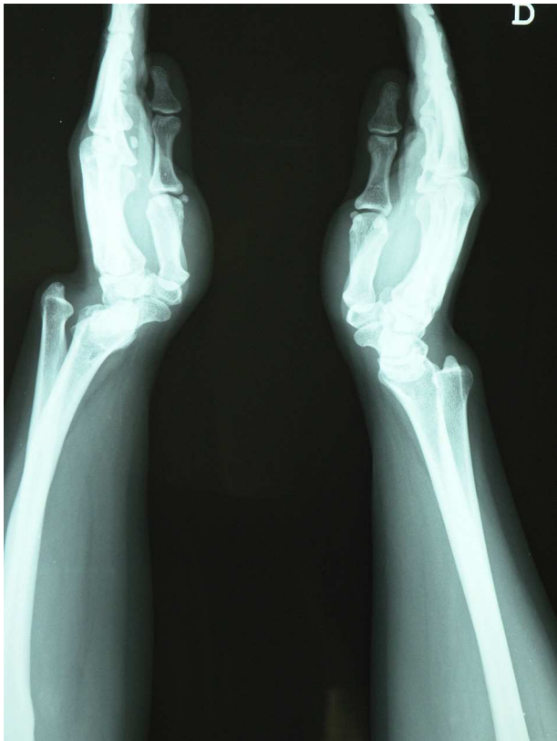
Fig. 3. Lateral X-ray of both wrists.