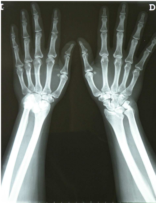
Fig. 2. Posteroanterior X-ray of both wrists.