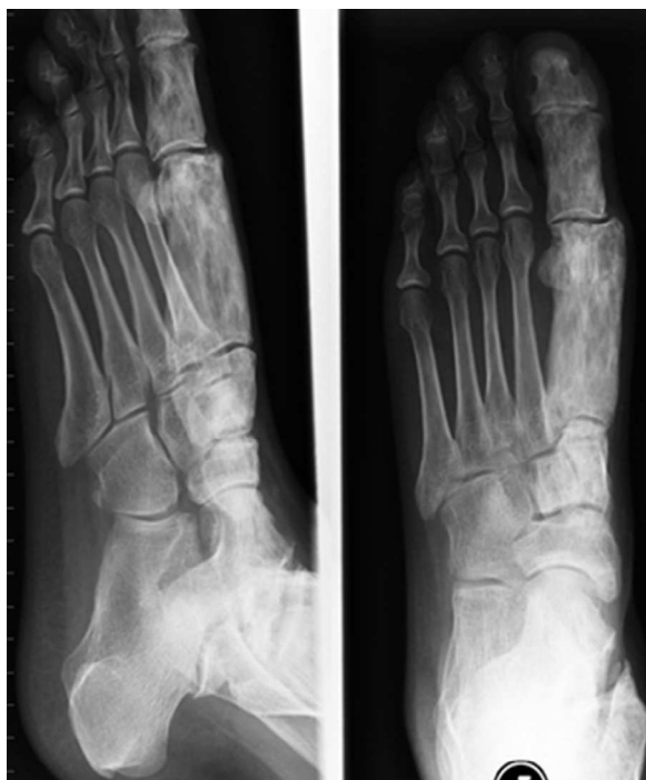
Fig. 3. Lateral and anteroposterior X-ray of the left foot with thickening of the metatarsal and phalange of the first right toe.

onset and extraskeletal manifestations. 2 The malignancy rate is rare. 6