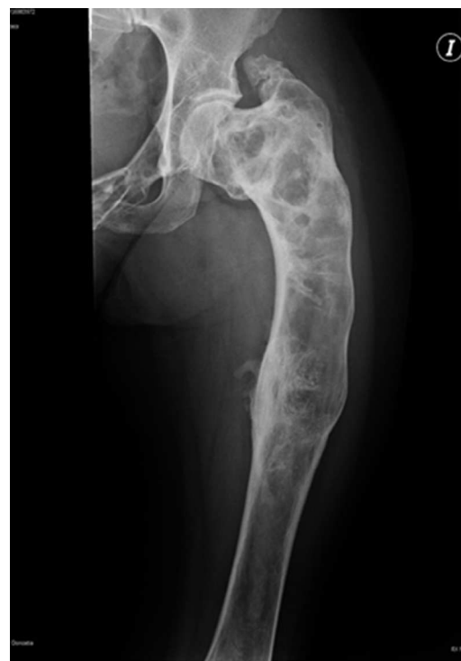
Fig. 1. Anteroposterior X-ray of the left femur with a «shepherd's staff» deformity, a thin cortex and expansive radiolucent images.

The polyostotic form is observed in 30% of cases. It is usually diagnosed during the patients' infancy. It affects the cranium, face, pelvis, spine and shoulder. It is associated to the McCune-Albright syndrome in 2% of cases (FPD, skin pigmentation and early puberty). 2 It leads to dysmetria, gait abnormalities, mechanical pain and stress fractures. 5 FPD diagnosis is radiological, rarely requiring a bone biopsy. The prognosis depends on the extension and degree of bone affection, age at