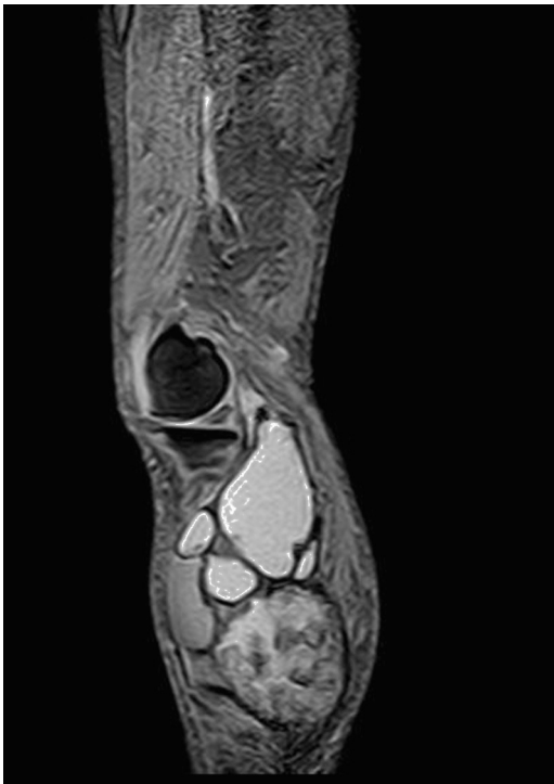
Fig. 4. MR. Sagittal STIR image. The hematoma shows diffuse increased signal intensity.

produce neurovascular compression phenomena at the popliteal level, being associated with 2,3 other conditions, such as rheumatoid arthritis. 4,5 Both for possessing a broad spectrum of presentations and the characteristics of the synovial liquid seen by ultrasound sometimes makes this a diagnostic challenge. 6,7