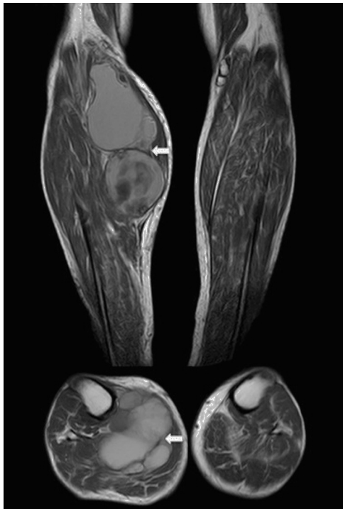
Fig. 3. MR. Axial and coronal T1-weighted images. Well circumscribed mass (arrows). Increased intensity signal compatible with a subacute presence of blood products.