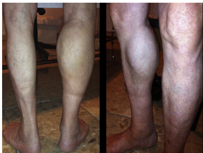
Fig. 1. Gastrocnemius asymmetry.

We present the case of an 83-year-old male patient with osteoarthritis, who came to the emergency room due to acute inflammation of the leg simulating DVT. On physical examination, there was a mass of elastic consistency, non-pulsatile, painful, in the popliteal fossa, extending to the leg (Fig. 1). The differential diagnosis was made with Baker cyst. The patient underwent, as a