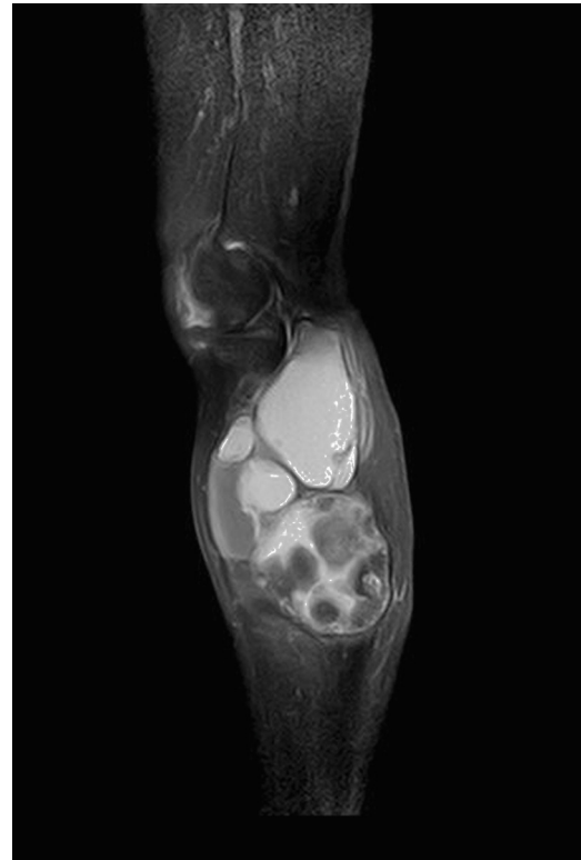
Fig. 5. MR. Sagittal T1-weighted image with fat saturation. Peripheral potentiation is observed compared to the precontrast image but no significant image central enhancement, indicating its cystic nature.