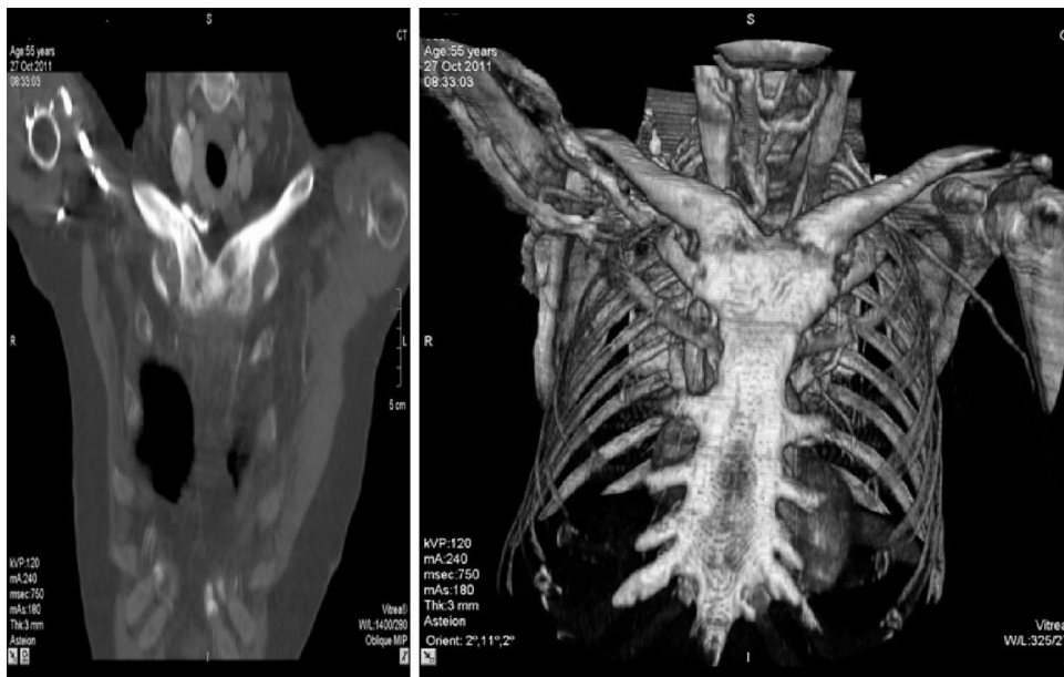
Fig. 1. CT scan of the chest where clavicular hyperostosis and ankylosis of the sterno-clavicular joint are observed. Source: Rosero et al. 13