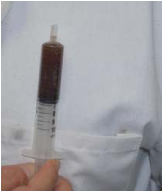
Fig. 2. Joint fluid obtained during arthrocentesis.