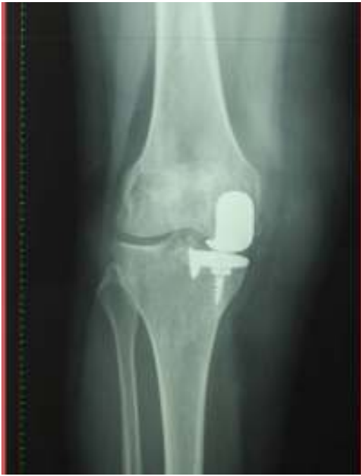
Fig. 1. Anteroposterior radiograph of right knee showing the unicompartmental prosthesis.