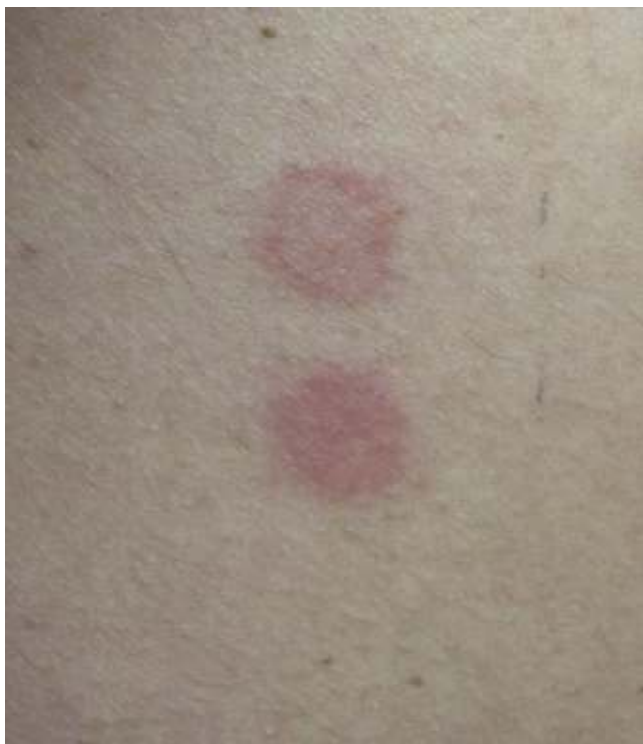
Fig. 2. Positive patch tests 72 h after exposure to methylisothiazolinone (top) and ultrasound gel (bottom).