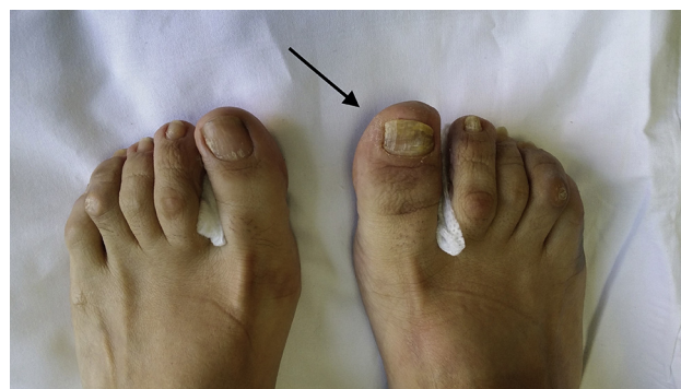
Fig. 1. Physical examination of both feet shows onychodystrophy, dactylitis and periungual erythema (arrow) in the great toe of the right foot.

This radiological finding is referred to as “ivory phalanx”, and is a characteristic sign, but not very widely known in psoriatic arthritis. It is related to periosteum and endosteum condensation with trabecular thickening, leading to a homogeneous increase in the radiological density of the phalanx, giving it an image of global sclerosis that reminds us of ivory. 2 It occurs most often in the distal phalanx of the great toes; it can be bilateral and can even affect