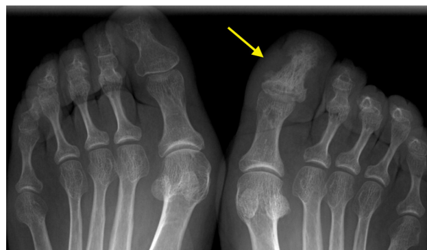
Fig. 2. Anteroposterior radiographs of both feet. The distal phalanx of the great toe of the right foot shows global sclerosis with the appearance of “ivory” (arrow).