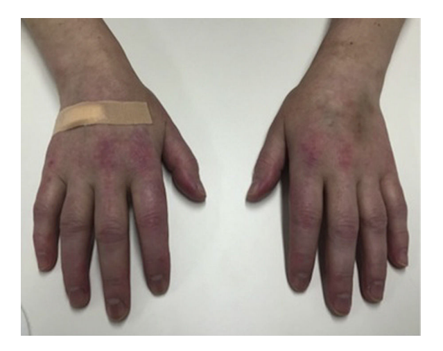
Fig. 1. Photograph showing Gottron papules over the extensor surfaces of metacarpophalangeal joints of both hands.

and limbs; she also had a mild proximal weakness in upper and lower extremities and symmetrical polyarthritis in elbows, hands and knees. The rest of the physical examination showed no pathological findings, including auscultation of heart and lungs.