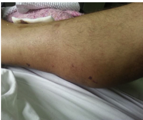
Fig. 1. Calf swelling.