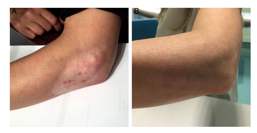
Fig. 1. (A) Skin hypopigmentation and subcutaneous fat atrophy in the right elbow of the patient after corticosteroid injections; (B) elbow surface 24 months after fat graft.