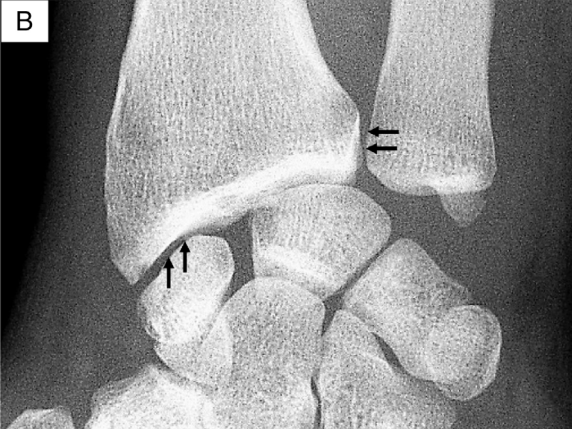
Fig. 2. Radiography images of the wrists. (A) Anteroposterior projection, with radiocarpal joint space narrowing and subchondral sclerosis of the radium of the right wrist. (B) Detail of the right wrist, with linear calcifications of the distal radio-ulnar and radio-carpal joints (arrows).