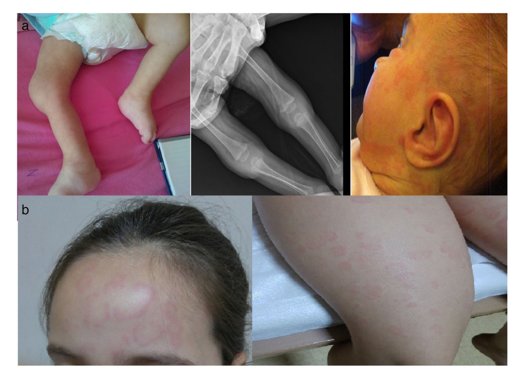
Fig. 1. (a) The view of the arthropathy and rash of CINCA patient. (b) The view of the rash of FCAS patient.

was increased gradually up to 12 mg/kg/month. She is being followed for 3.5 years and currently under monthly canakinumab (12 mg/kg/month) injections with normal APR and without further attacks. Neurological development of the patient is compatible with her age.