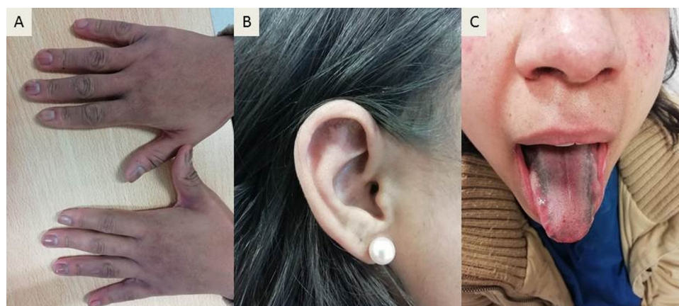
Fig. 1. Hydroxychloroquine induced melanosis. Hydroxychloroquine induced melanosis of the nails of the hands (Panel A), the scapha and triangular fossa of the ears (Panel B) and the tongue (Panel C).

A 29-year-old Brazilian woman with a previous diagnosis of Systemic Lupus Erythematosus with articular, cutaneous, serous and hematological involvement who immigrated to Portugal 7 months prior presented to our rheumatology department for continuation of care. She was chronically medicated with hydroxychloroquine 400 mg for the past 10 years as well as prednisolone 10 mg and levothyroxine 88 mcg. The objective examination showed hyperpigmentation of the nails of the hands (Fig. 1 – Panel A), the scapha and triangular fossa of the ears (Fig. 1 – Panel B) and the tongue (Fig. 1 – Panel C) that was suggestive of hydroxychloro-