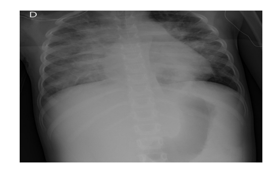
Fig. 1. Portable chest X-ray. Bilateral pulmonary parenchymatous opacity of central predominance, compatible with pulmonary edema. Mild bilateral pleural effusion of right-dominance.

The child arrived at PICU with pallor, poor perfusion, acrocyanosis and more than 10s of capillary filling. She had bilateral